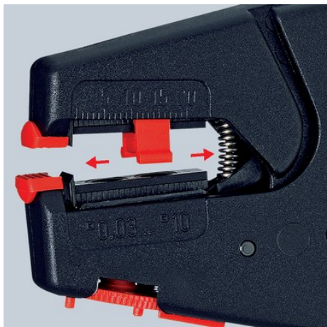
12 40 200: Adjustable length stop