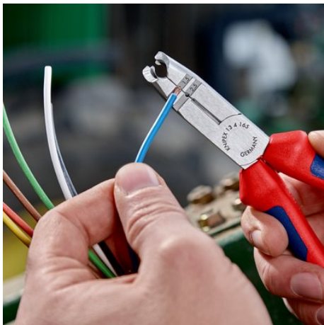
wire stripping holes for 1.5 and 2.5 mm² conductors