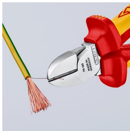
clean cutting of thin copper wires, also at the cutting edge tips