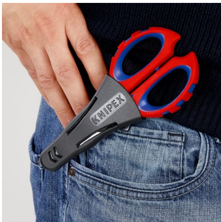
Securely stowed and always at hand