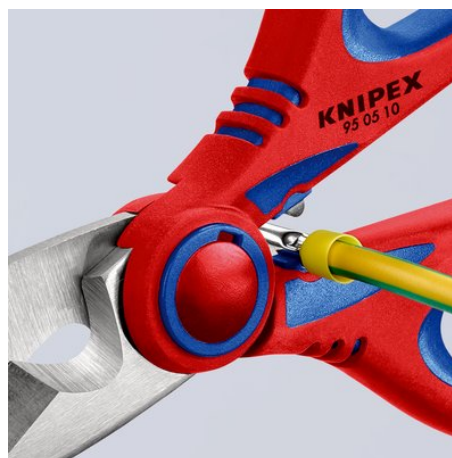
95 05 10 SB: Fast, easy crimping